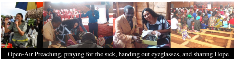
Open-Air Preaching, praying for the sick, handing out eyeglasses, and sharing Hope

Sat Oct 18: 2pm-5:30pm, Shalom Church “Maintaining Spiritual Freedom”